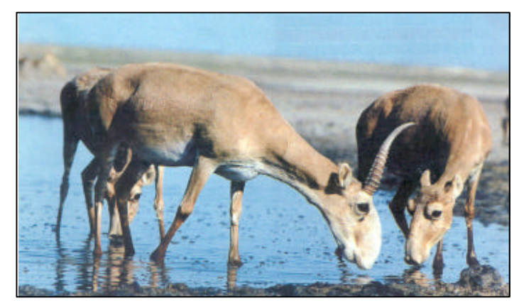
Saiga antelope. One of the few large steppe animals that is still relatively abundant. However it is threatened by poaching and habitat loss. Reprinted courtesy of the National Strategy and Action Plan on Conservation and Sustainable Use of Biological Diversity of the Republic of Kazakhstan.

Steppe habitats are favored by rodents such as ground squirrels ( Citellus ), hamsters ( Cricetus, Cricetulus, Podopus ), voles ( Microtus ), lemmings ( Lagurus ), and marmots ( Marmota bobac ). The only ungulate common in the southern steppes is the saiga antelope ( Saiga tatarica ), which was at the verge of extinction in the early 20<sup>th</sup> century but has since recovered, although there is evidence of a recent decline. Wolves ( Canis lupus ), foxes ( Vulpes vulpes, V. corsac ), and steppe ferret ( Mustela eversmanni ) are typical carnivores in this ecosystem.