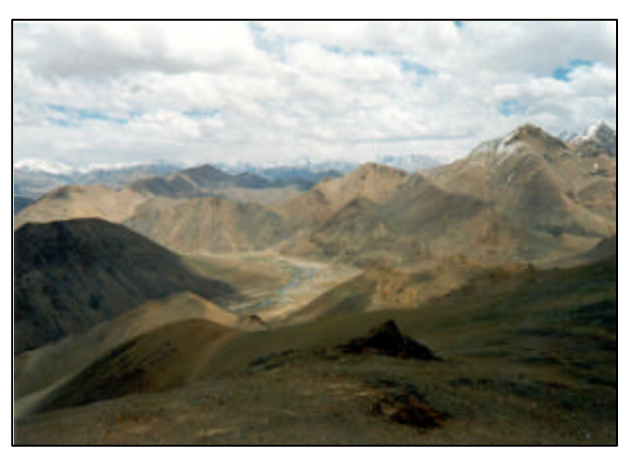
High mountain peaks are home to wild sheep, goats, and snow leopards.

In the West Tien-Shan, lower altitudinal belts are occupied by ephemeral semideserts, while higher (1200 to 2000 m) vegetational zones contain open mountain meadows and steppes (dominated by Elytrigia trichophora , E. repens , Poa bulbosa ) mixed with juniper woodland ( Juniperus turkestanica , J. semiglobosa , J. seravschanica ). Valleys and riparian tracts in the semi-arid steppe zones contain willow, spruce, poplars, Elaeagnus , and tamarisk.