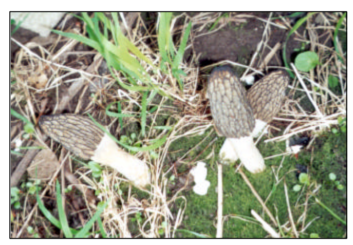
plants are used for the production of essential Morels. Edible fungi such as these provide an important resource for local populations, with potential for small-scale commercial production.

Many species of wild plants in Kazakhstan are harvested intensively for food, medicine, and construction. The most important wild food plants are apples ( Malus sieversii ), apricots ( Armeniaca vulgaris ), hawthorns ( Crataegus spp. ), and barberry ( Berberis spp. ). Annual yield of apples, hawthorn, and apricot by forest industry in Kazakhstan is approximately 300 tons. Valuable tanning plants include Polygonum , Rumex , and Rheum spp. Reeds ( Phragmites , Achnatherum ) are used in household construction. Not less than 70 species of plants are used for the production of essential oils (including species of Artemisia ,