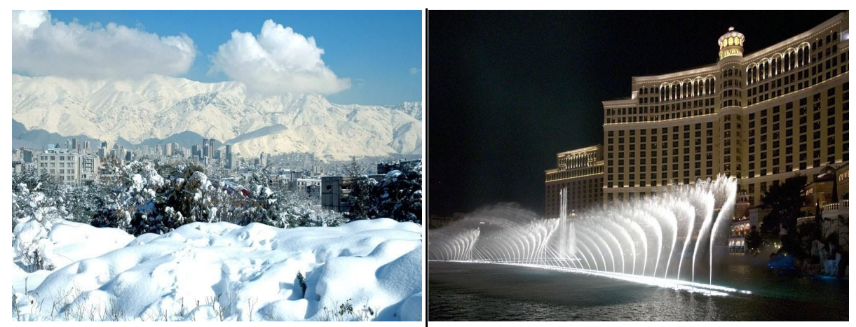
Tehran Attractions and Nature

There are many hotels of different categories available in Tehran and near DOE building. Also, many hotel apartments could be found in the city at a very reasonable price. Tehran has many modern restaurants, serving both traditional Iranian and cosmopolitan cuisine. However, Western-style fast food is quite popular too. There are many modern shopping centre providing national and imported goods and food staff and ingredients from all over the world.