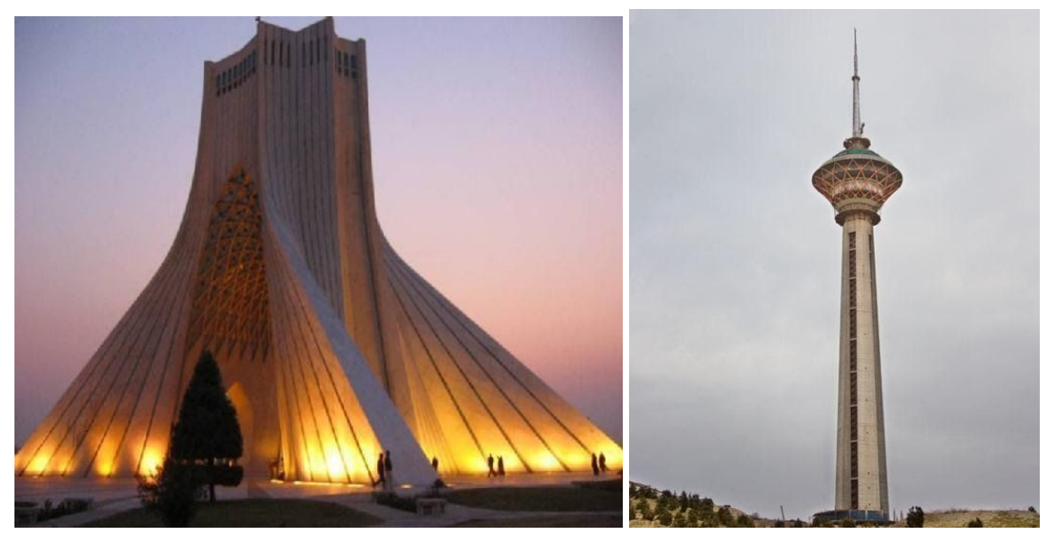
Tehran Azadi Tower Complex