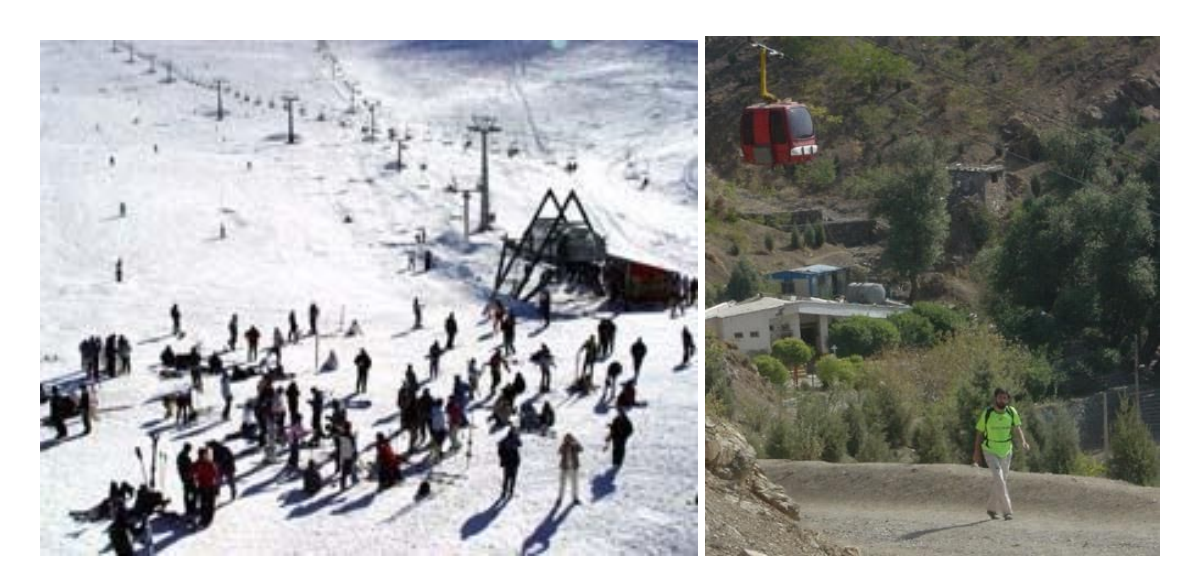
Tochal Ski Resort & walking area - 30 minutes to North