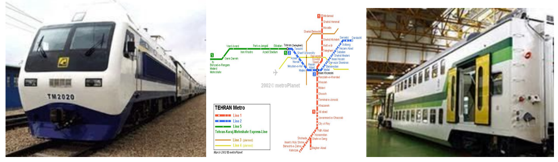
Tehran & country side Metro

There is a large restaurant inside the main DOE building. There are 2-3 small kitchens in each floor of the building which serve tea/ coffee breaks free of charge during the working hours. There is also a new coffee shop under construction outside the main building.