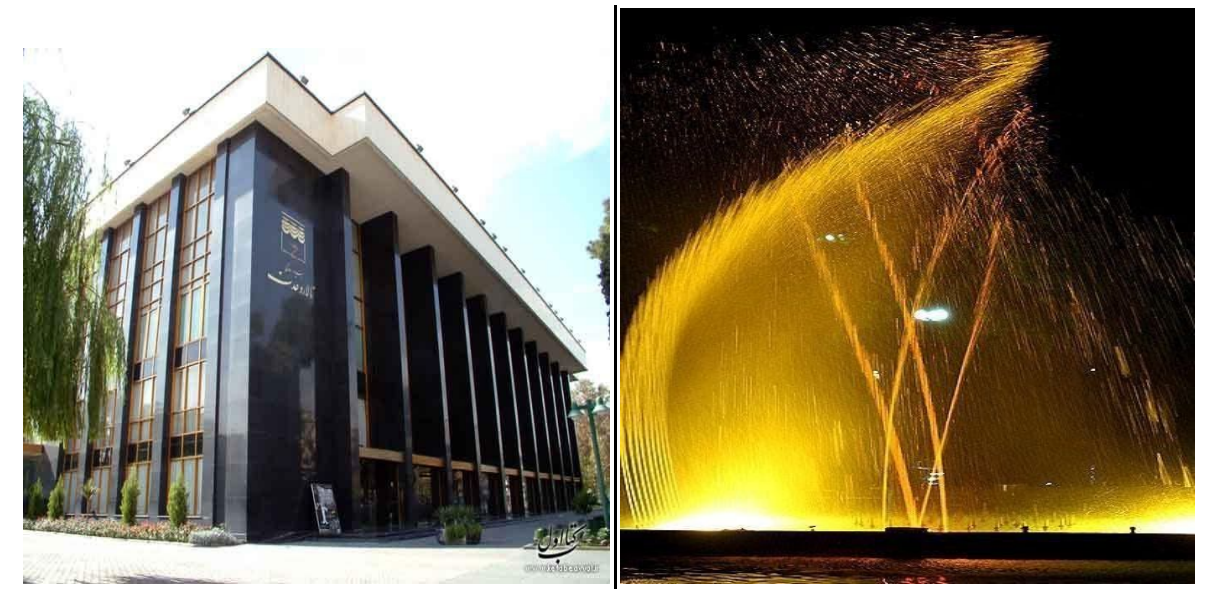
Vahdat Theatre- Over twenty Theatres in Tehran

Travelling from Tehran to Ashgabat and vice versa is easily possible by road as it just takes two and half hours from Mashhad, one of the biggest city of Iran trough a beautiful road to Ashgabat. There are at least four flights between Tehran and Mashhad every day at a reasonable price. However direct flight from Mashhad/Tehran to/from Ashgabad is expected to be reopened in near future.