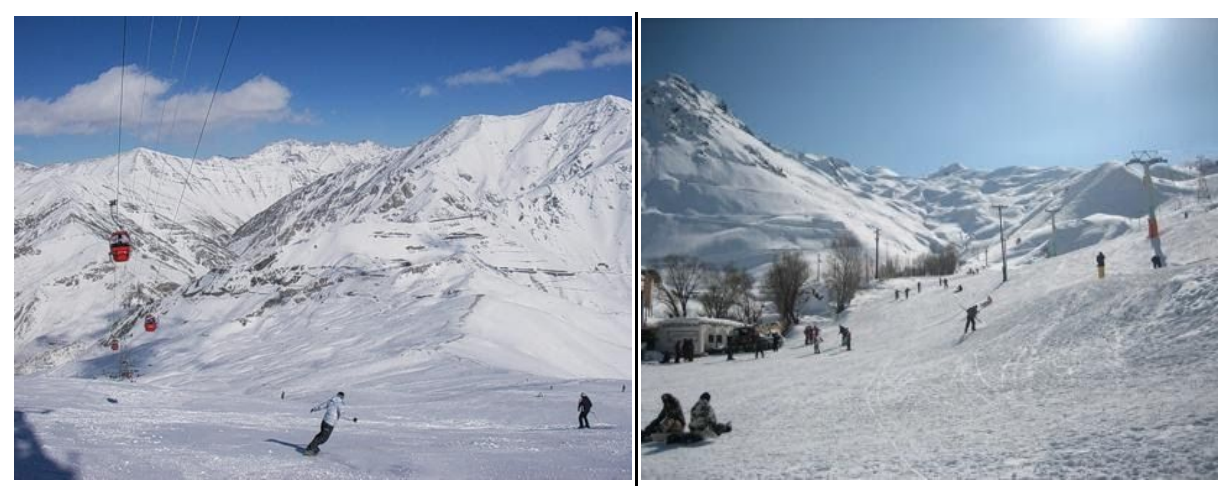
Tehran country side- Dizin Snow Ski Resort- Ninety Minutes from Tehran

Under supervision of DOE, there is also a building under construction in Ramsar (by the Caspian Sea) which is designed to serve the Ramsar Convention and Caspian related activities. May the Tehran Convention Secretariat wish a branch office, could be offered there as well.