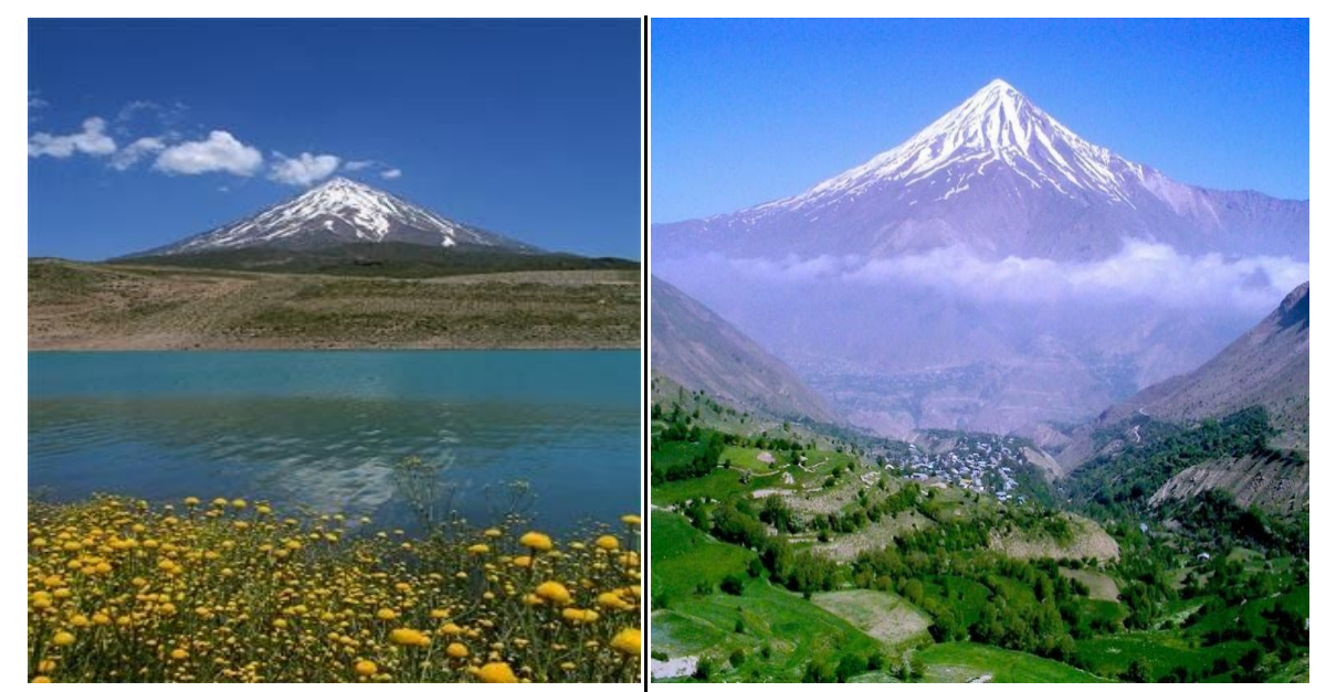
Damavand and Laar River & lake beside it- Ninety Minutes from Tehran

4.2 Any other information that the potential host country may deem relevant.