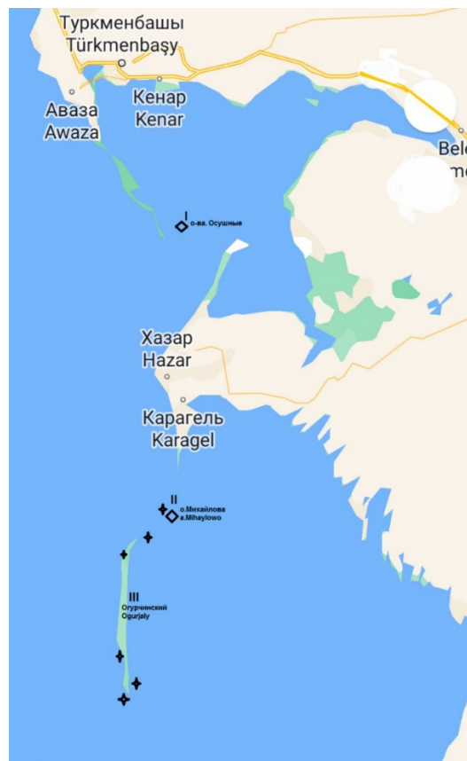
Fig. 1. Locations of registered encounters with Caspian seals in the Turkmenistan area of the Caspian Sea, April – June, 2022: I – Bolshoy Osushnoy and Malyy Osushnoy islands; II – Mikhailova Island; III – Ogurjaly Island; black marks indicate locations of the registered encounters with Caspian seals.

One of the research objectives was to survey the Caspian seal in the Khazarskiy State Nature Reserve (the Khazarskiy and Esenguliyskiy sectors, the Ogurchinsky Sanctuary). Expeditionary routes included Bolshoy Osushnoy Island and Malyy Osushnoy Island in the Turkmenbashi Bay, as well as the Yuzhnaya Chelekenskaya Spit, Mikhailova Island and Ogurjaly (former Ogurchinskiy) Island in the Turkmen Bay (Fig. 1), where the Caspian seal haul outs were most often registered in 2016-2021 (Rustamov et al., 2021).