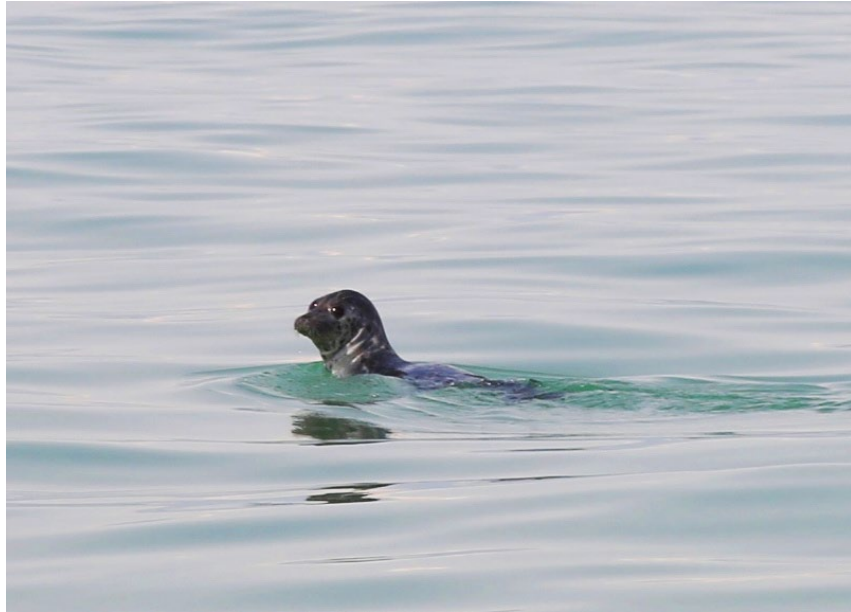
Fig. 3. A Caspian seal is near the southern spit of Ogurjaly Island, 06.26.2022.

From the beginning of July to the end of October, 2022, no Caspian seals were encountered in the monitoring areas.